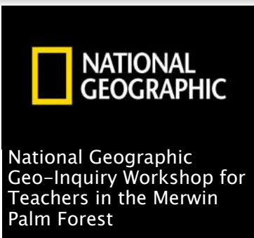
National Geographic Geo-Inquiry Workshop for Teachers in the Merwin Palm Forest