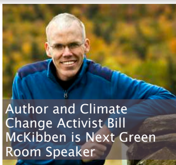
Author and Climate Change Activist Bill McKibben is Next Green Room Speaker