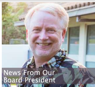
News From Our Board President