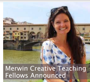
Merwin Creative Teaching Fellows Announced