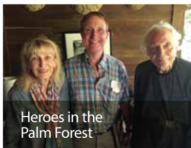
Heroes in the Palm Forest

Young Hearts & Minds Touched by Merwin's Legacy