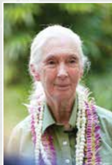
Jane Goodall at the World Conservation Congress

Late summer was an exciting time for nature lovers in Hawai'i, as the International Union for the Conservation of Nature (IUCN) World Conservation Congress – the world's largest and most inclusive environmental decision-making forum – held its first-ever US meeting in Honolulu from Sept 1st - 10th. Thanks to your support, The Merwin Conservancy staff was able to attend and represent the vision of W.S. Merwin alongside nearly 9,000 delegates from 184 countries. Conservancy staff took part in many educational and networking opportunities, including a session featuring renowned primatologist Jane Goodall, the IUCN's Honorary Patron of Nature.