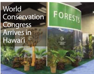
World Conservation Congress Arrives in Hawai'i