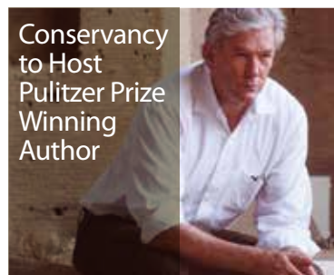
Conservancy to Host Pulitzer Prize Winning Author