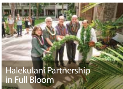
Halekulani Partnership in Full Bloom