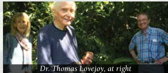
Dr. Thomas Lovejoy, at right