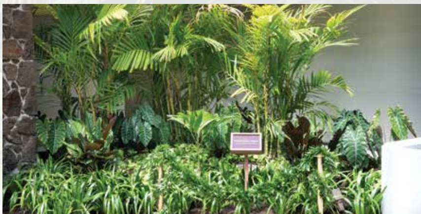
The W.S. Merwin Garden at Halekulani in Waikiki

This is the beginning of a beautiful partnership – Halekulani will continue to weave W.S. Merwin's words and values throughout the hotel experience for many months to come. The Merwin Conservancy is grateful for the Halekulani's tremendously creative and generous support.