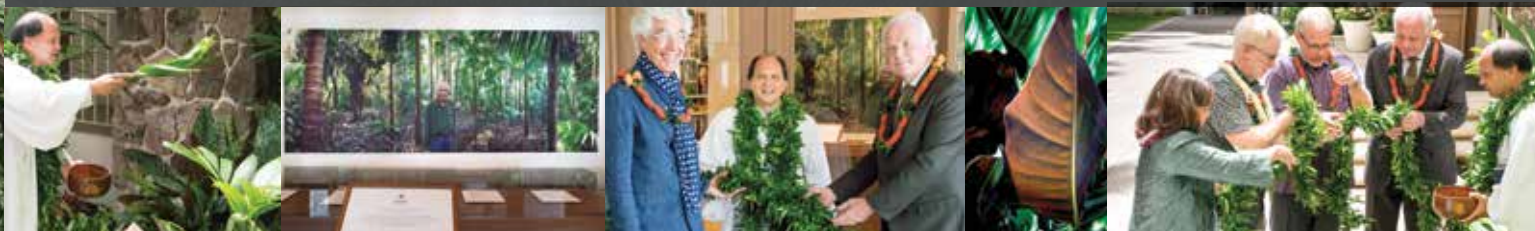
The blessing & dedication at Halekulani on September 2nd

In our Spring newsletter, we announced the Halekulani-sponsored nationwide Earth Day/Poetry Month PBS broadcast of the documentary W.S. Merwin: To Plant a Tree . That effort brought the story of W.S. Merwin and his palm forest into the homes of hundreds of thousands of viewers, tuning in for a total of 80 different airings in 43 states across the U.S. Halekulani's sponsorship was a great success, and marked the beginning of a beautiful friendship between our two organizations.