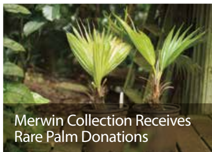
Merwin Collection Receives Rare Palm Donations