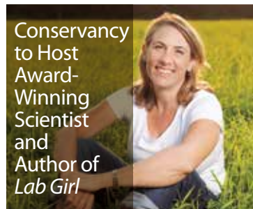
Conservancy to Host Award- Winning Scientist and Author of Lab Girl