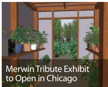
Merwin Tribute Exhibit to Open in Chicago