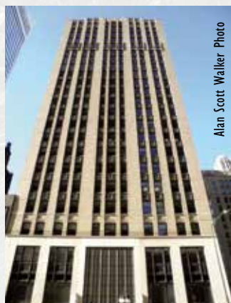
American Writers Museum's new Chicago location