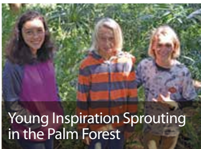
Young Inspiration Sprouting in the Palm Forest